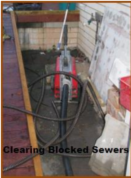
Clearing Blocked Sewers