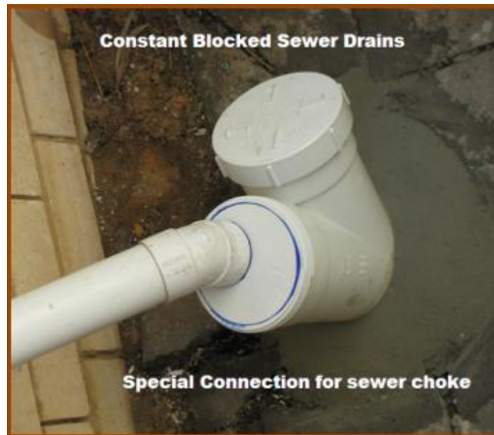
Constant Blocked Sewer Drains