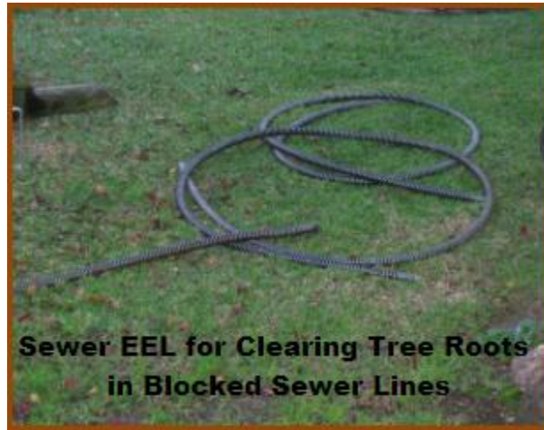
Sewer EEL for Clearing Tree Roots in Blocked Sewer Lines

Recently had Adam from AA Weeks plumbing cleared my blocked sewer line which was caused by the roots from an Oleander Tree getting into the pipes and completely blocking the pipes. This is always occurring so Adam fitted a special PVC pipe connection so the sewer choke can connect through the sewer line without breaking the inspection hole